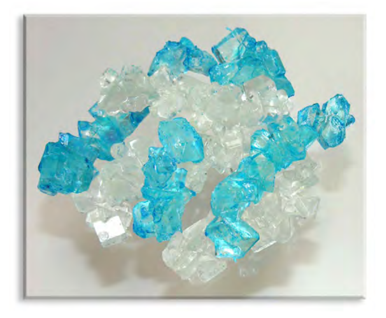
Fig 7.4.2 – These are sugar crystals formed on strings suspended in supersaturated sugar water. As water is heated, sugar will dissolve more readily into solution until it becomes 'supersaturated.' As the high-temperature, saturated-sugar solution is cooled, sugar crystals precipitate out of the water onto the strings. Blue dye provides added color. This is the process for making this tasty'rock candy' treat. It is essentially by the same process that massive, natural salt formations are formed.

portant salt in both geology and biology is NaCl—common table salt. When water temperature is increased from 0° to 100° C, the solubility of NaCl increases from 35g/100 mL to nearly 40g/100mL. Like our sugar crystal example, supersaturated NaCl solutions will allow salt crystals to precipitate from the solution when the temperature drops (although not as dramat-