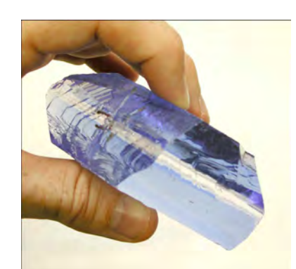
Fig 7.4.14 – This is a manmade quartz crystal grown for technological purposes. The clear strip seen in the bottom photo is the quartz 'seed' while the blue material is the grown quartz. The addition of the element chromium is responsible for the blue color.