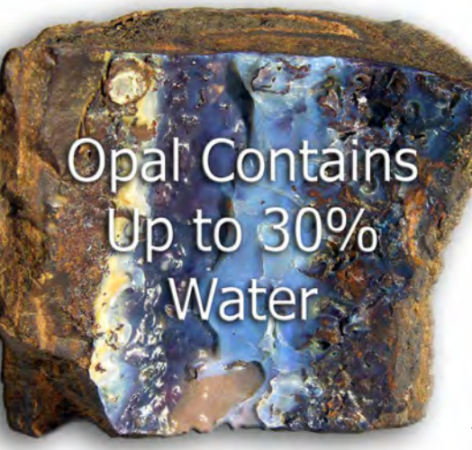
Fig 7.4.8 – This rainbow colored rock specimen is natural opal. Opal is one of the wettest rocks on Earth, holding formative water of up to 30%. Most high quality opal comes from mines located in Australia, but it can be grown synthetically. In nature and in the laboratory, water is essential in opal formation.

There is another mineral that can contain even more water—opal. Opal can have an astonishing 30% of water by weight. Like many of