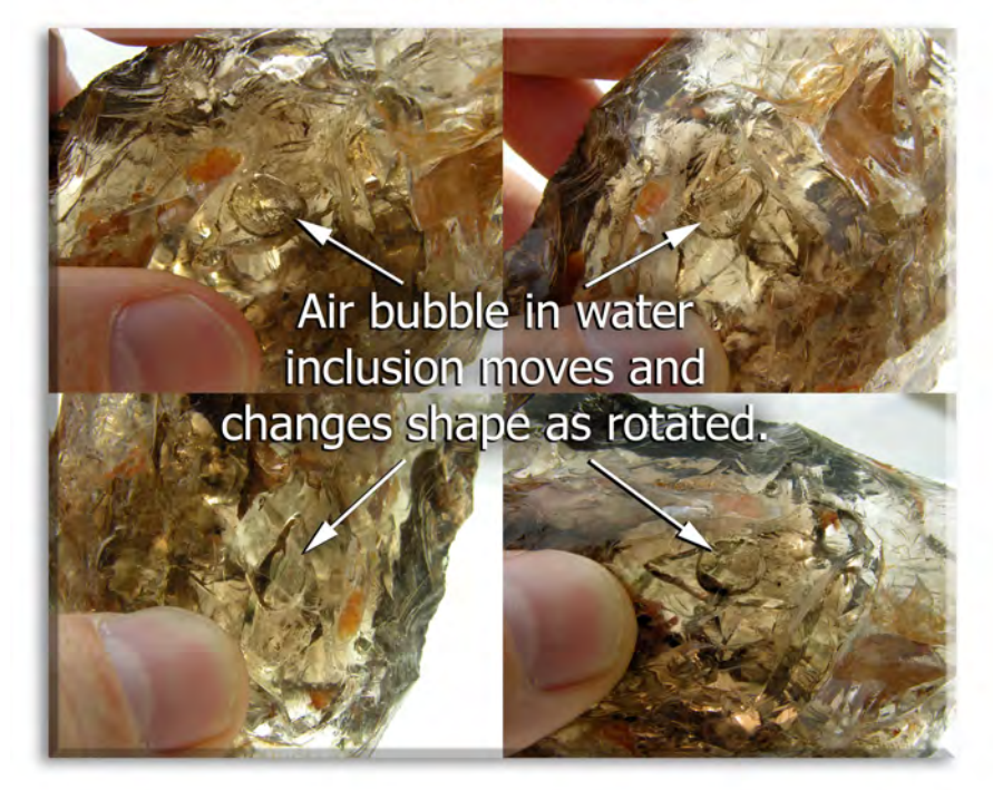
Fig 7.4.4 – These four photos were taken as this Brazilian quartz crystal was rotated. The photos show how the bubble in this specimen moves and changes shape as the rock is rotated.

low seawater (around 1 meter or less) has ever been observed to evaporate and leave behind solids. When this happens, all six salts within the seawater will be present, often deposited in layers. There is no possibility of large homogeneous deposits of a single type of salt, forming from evaporation. It is because of this the Salt Mystery exists. Now, with the understanding of the prethermation process, we can describe the origin of the massive salt deposits.