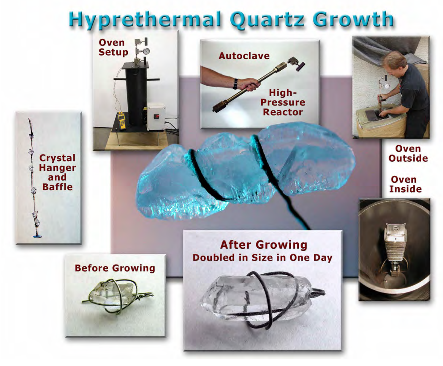
Fig 7.4.13 – This diagram illustrates the hyprethermal quartz-growth process. The word hyprethermal is a merger of the words "hydro" (water), "pre" (pressure), and "thermal" (heat). A combination of these three physical properties creates a pressurized thermal environment in which quartz crystals can grow. In this diagram, a hanger holding quartz crystal seeds is placed in the high-pressure reactor. A water solution is added to the reactor and it is placed in an oven and heated until the solution reaches 350-400° C. Compare the images of the crystal before growing and after growing. The crystals experienced a rapid growth rate approximately doubling in size in one day , not over millions or even thousands of years.

Fig 7.4.15 is natural sandstone matrix with natural white quartz and a layer of synthetic amethyst (purple crystals) quartz