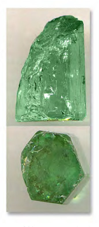
Fig 7.4.16 – Flux-grown (melt) synthetic emeralds have no water in their crystal matrix, whereas all natural emeralds do. Natural emeralds grow in the same manner as quartz but higher pressures and temperatures.

Fig 7.4.17 shows various forms of crystalline quartz and the Silica Phase Diagram. These were introduced in the Magma Pseudotheory chapter. They illustrate the differ-