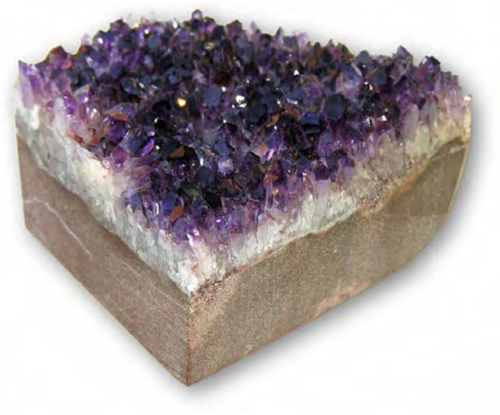
Fig 7.4.15 – This is a cross section showing natural quartz (white) on a sandstone base with synthetic amethyst quartz (purple) grown on top of the natural quartz. This specimen was made in Russia where much research involving the use of autoclaves was conducted, prior to the collapse of the Soviet Union. This specimen helps illustrate how natural quartz grows in a hypretherm.

This important statement has profound consequences. A gemologist, not a geologist identified the two types of quartz as being "indistinguishable." As is often the case, the researchers