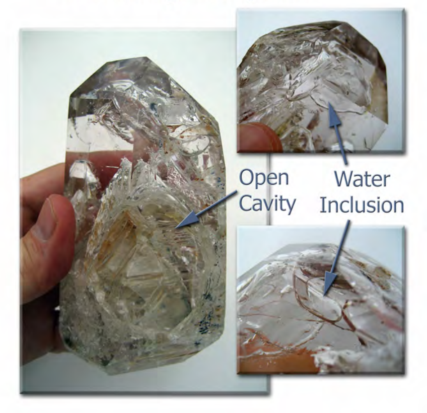
Fig 7.4.6 – This specimen is a large, naturally formed quartz crystal enhydro. It has a large amount of freely moving water and a large open and exposed cavity. The exposed empty cavity, indicated in the diagram, shows where a large water inclusion once existed before it escaped the crystal, probably from the pressure exerted by the freezing or heating of the water. Enhydros can also indicate specific environmental forces that existed at the surface locale of the Earth where the specimen was originally found.

in the Earth, as modern geology teaches—why don't rocks at the bottom of the Grand Canyon contain enhydros? In the next chapter, we will discuss why these enhydro rocks are found near the surface—because they formed on or near the surface . This suggests that wherever they are found, enhydros provide direct physical evidence that the surface of the Earth must not have changed dramatically since the formation of these water-filled rocks.