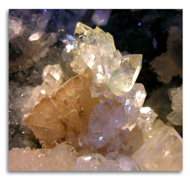
Fig 7.4.18 – We find beautiful crystals like these in veins and geodes around the world. They can only be reproduced by man in a lower temperature/ high pressure water environment verses a melt. However, these crystals are no different from others found in so-called igneous and metamorphic rocks that were supposed to come from much higher pressures and temperatures and without much or any water. The crystals we can hold in our hands actually testify to how the Earth's rocks were originally formed—in a hypretherm.

Quartz veins are found in the highest mountains, and in many rock types. Some of these were quite obviously cut in after the mountain or rock formation was formed. Geodes and quartz vein growth is not known to be happening anywhere on Earth today, yet it did occur all over the surface of the Earth a rela tively short time ago . We know how quartz is made, and there-