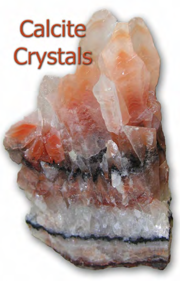
Fig 7.4.20 – This is a specimen of calcite , the second most common mineral type on the continents next to quartz-based minerals. This colorful piece came from Mexico, with the different colors representing various mineral substances that were in the calcite solution when this crystal grew. Large calcite crystals such as this have only been found to grow in a hypetherm.

Another sci-bi that attempts to explain the origin of calcite crystals is diagenesis. Diagenesis is a chemical or physical change that sediment undergoes after being initially deposited, during its lithification (becoming rock). Presumably, this occurs at low temperature and low pressure and is modern geology's proposed transition stage prior to metamorphism. These two terms, diagenesis and metamorphism, have been used to explain changes sedimentary rocks undergo, but a distinction between them is not clear because rock formation as a result of these processes has not been observed: