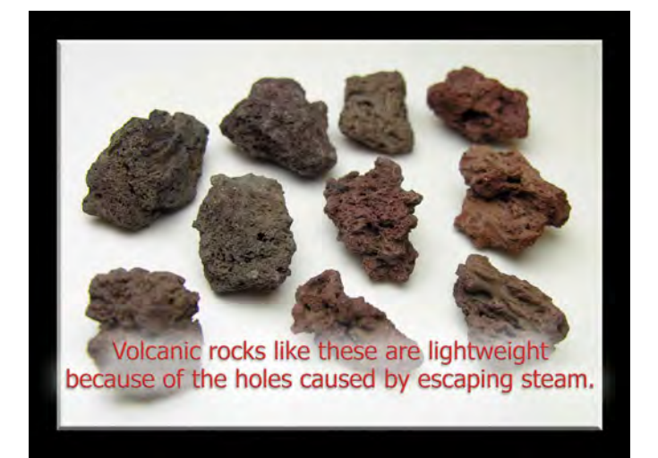
Fig 7.4.9 – These rocks are typical of volcanic rocks. They are amorphous (glass-like) and exhibit characteristic vesicles or 'holes' caused by escaping steam. Researchers have long known that "all volcanic rocks contain some water bound up in the minerals or the rock". This can be easily demonstrated by weighing the rock, slowly heating it and letting the rock cool, then weighing the rock again. The heat causes the water to expand and escape through micro fractures in the rocks.

Fig 7.4.9 is an image of several pieces of scoria, pitted lava rock. The pits, or holes, are called vesicles , and were formed