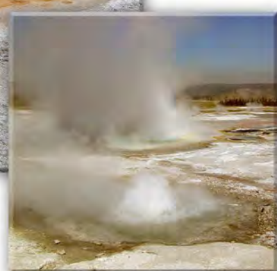
Fig 7.4.11 – Everyday rocks we walk on did not come from geysers or hot springs because there is negligible pressure in these geothermal springs. Geyserite is a form of opal and is a mineral formed in or near hydrothermal springs.

Geysers and hot springs do not produce quartz rocks and minerals because they are not under pressure.