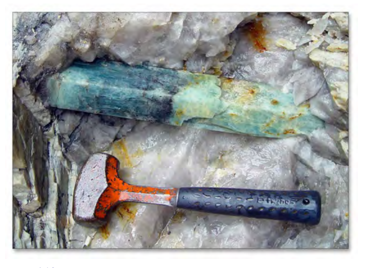
Fig 7.4.19 – Pegmatites often contain large crystals like this beryl crystal. They are important because they hold clues to how all rocks were made. All of the crystals in a particular pegmatite were made from the same materials at essentially the same time and in the same way. Researchers have finally begun to recognize that "An aqueous -rich fluid is regarded as the critical element in the genesis of pegmatites..."

Many times, researchers come close to bumping into the Hydroplanet Model. A 2002 paper, Contributions to Mineralolo gy and Petrology, several researchers described experiments