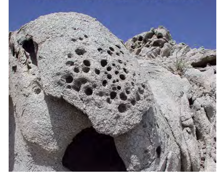
Fig 7.4.10 – This unique granite outcrop is located in Sonora Mexico near the Gulf of California. Most granite deposits do not exhibit holes like these. Researchers have attempted to form granite through experimentation of many pressure/temperature environments, all without water. They had no success. Eventually, they discovered that "the water content" was the "most critical factor" to simulate nature in growing granite, and without granite, there would be no continents.